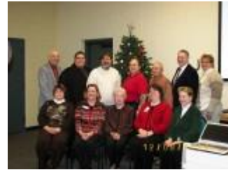
Grant presentation and all the awardees.